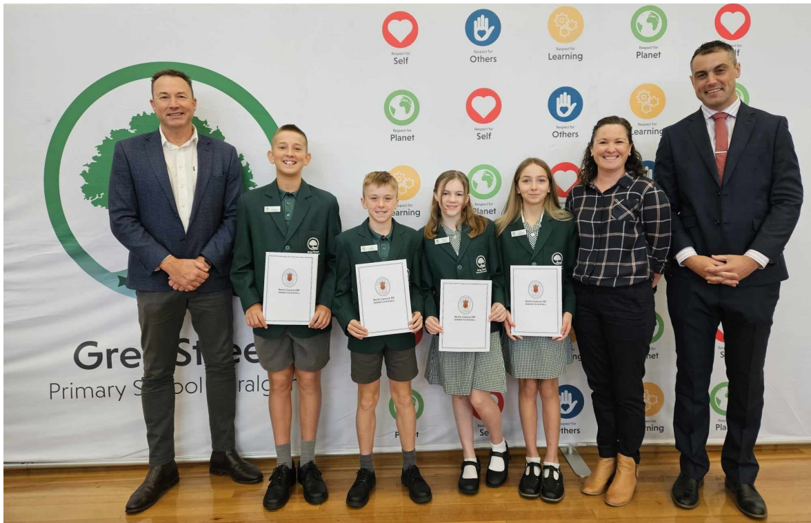
2024 School Captains