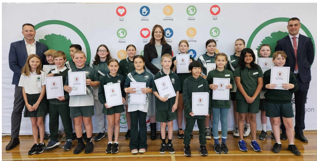
2024 Digital Technology Team