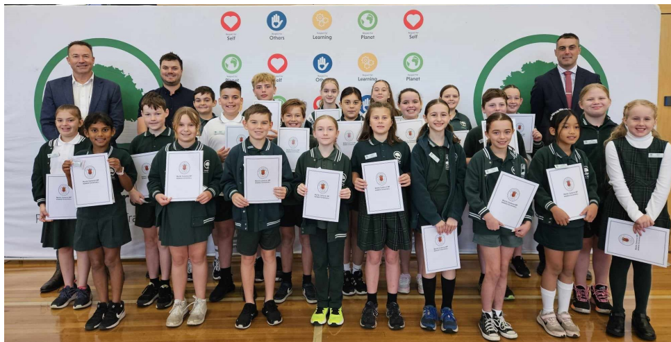
2024 Junior School Council