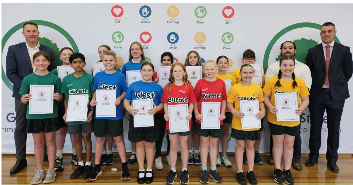
2024 House Captains