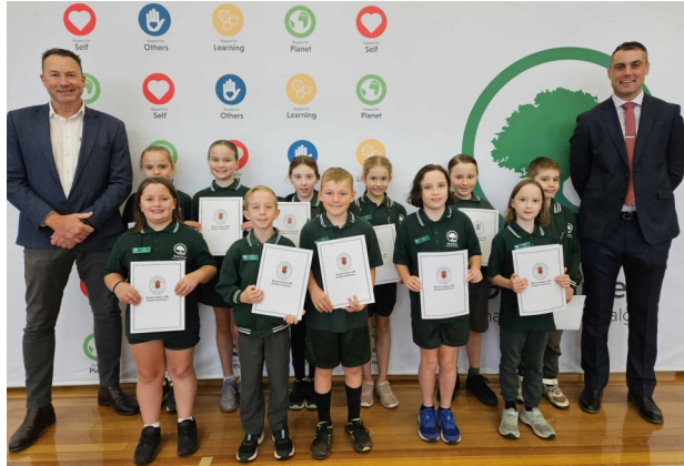
2024 Green Team